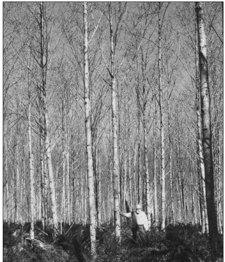
A 12-year-old red alder plantation on red alder site index 100 feet near Silver Lake, Wash.—three years after pre-commercial thinning from 600 to 360 trees per acre.

Thinning. Our understanding of density management and thinning in