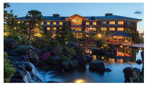
Campgrounds and additional lodging options in nearby Albany https://albanyvisitors.com/stay/

505 Mullins Dr., Lebanon, OR 97355 https://www.boulderfallsinn.com/ Reservations 541-451-1000 Request OSWA TOUR 2024 rates: Deluxe King or Double Queen $165.99 Executive King Suite $195.99